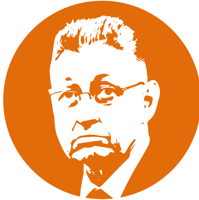
Sheldon Silver Democrat